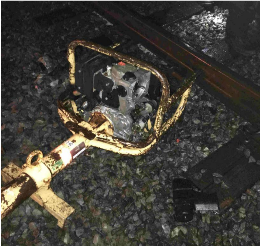
Photo 1 - Geismar Torque Wrench