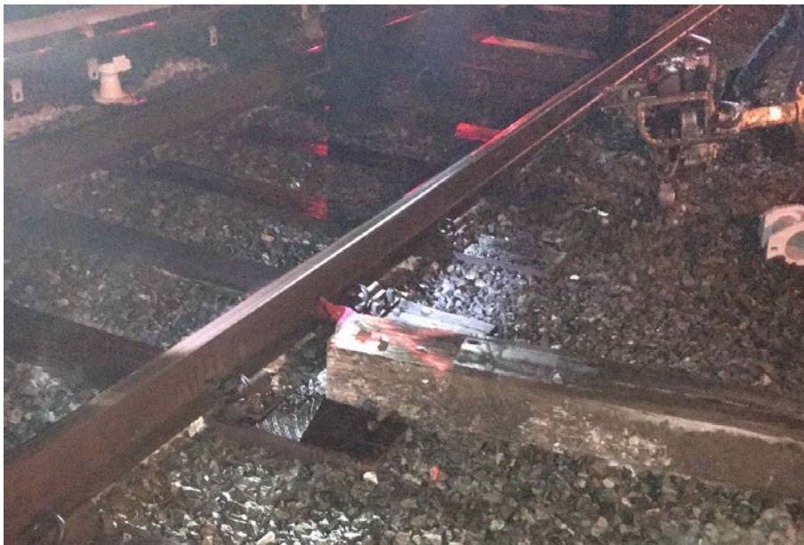
Photo 2 - Rail Tie