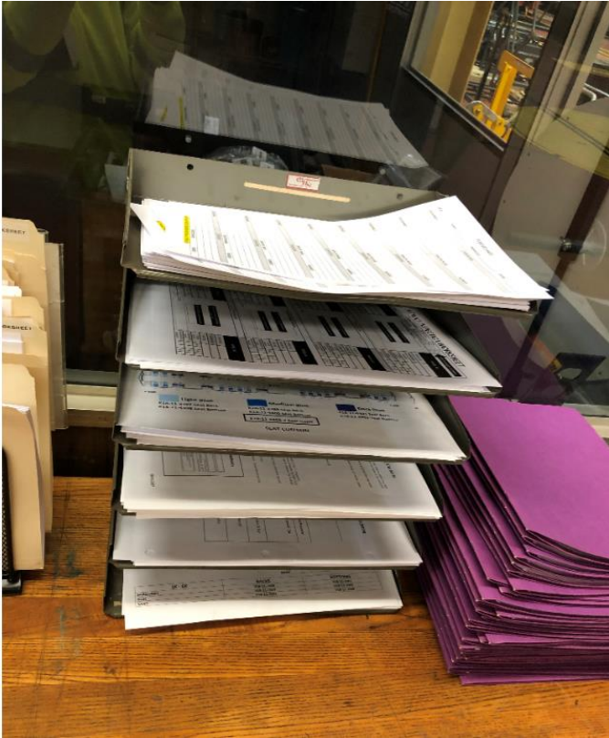
Photo 1 – PI books were properly organized and labeled for the task being performed

Photos 2 and 3 – Some special tools had an overdue calibration date