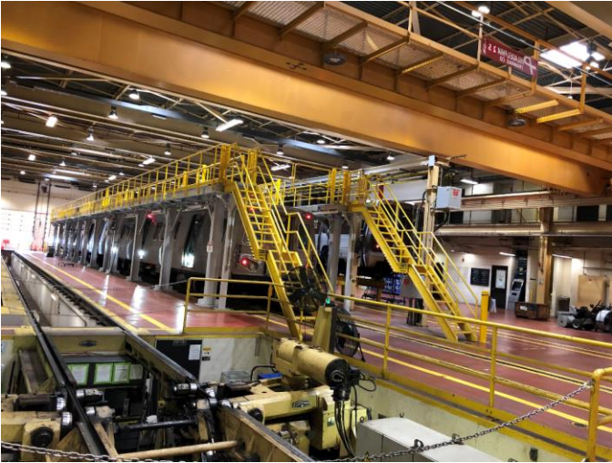
Photo 5 – Lighting inside open pits is poor and needs to be upgraded