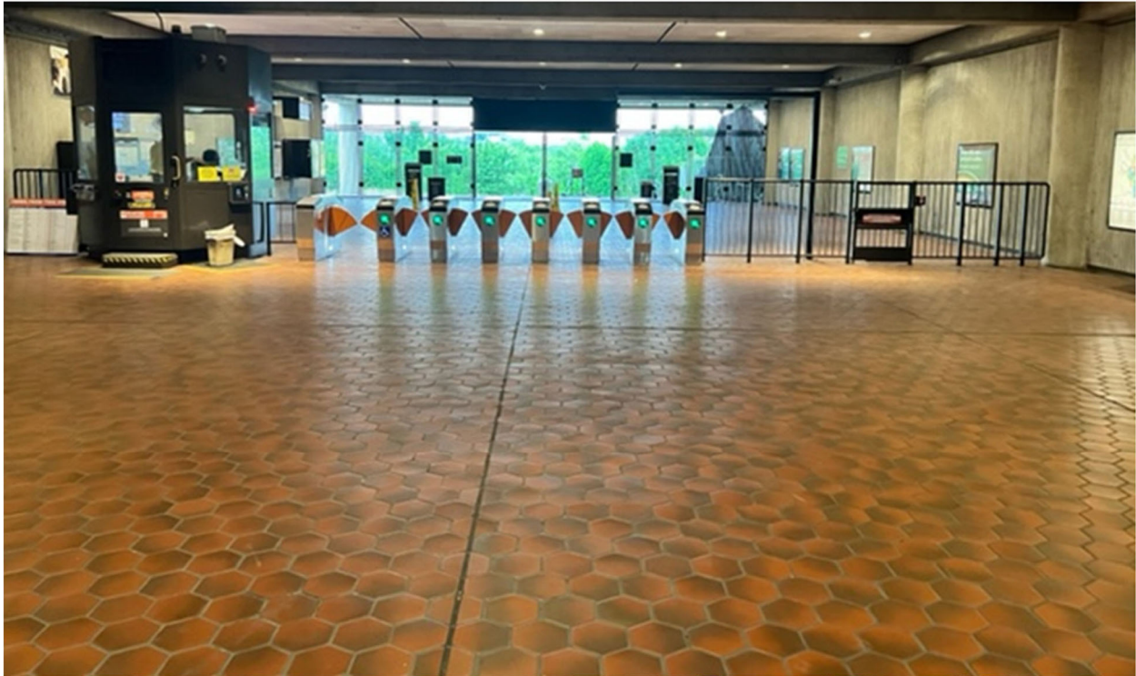
Figure 2 Anacostia Entrance