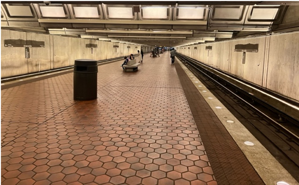
Figures 4 Anacostia Platform Viewpoint