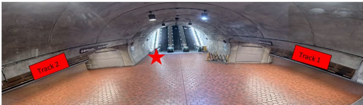
The above depiction is not to scale.