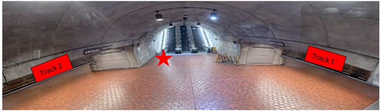
The above depiction is not to scale.

Incident Date: 05/18/2023 Time: 17:51 hours Final Report – Evacuation for Life Safety Reasons E23337