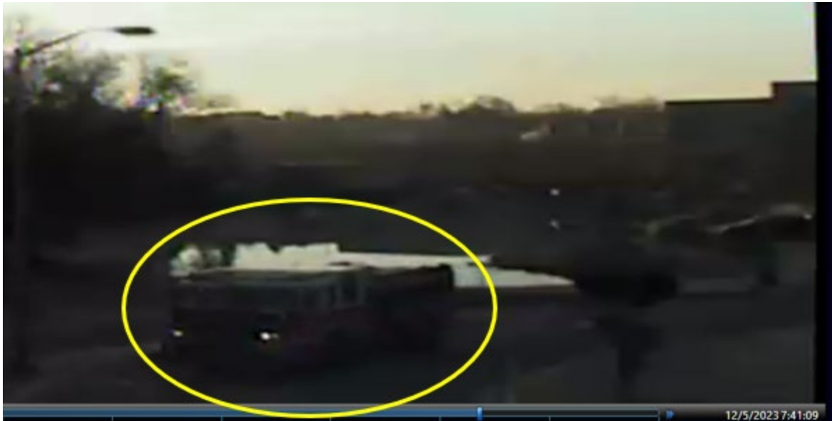
Image 2 – Image of Prince George's County Fire Department departing Greenbelt Yard at 07:41:09 hours.

At 7:54 AM, the CMNT Supervisor reported that the personnel had returned to the S&I Shop, located in Building B. PGFD had shut off the gas as they were unable to locate the source of the pull station fire alarm. An unknown source had notified Washington Gas of the gas leak.