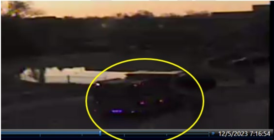
Image 1 - Image of Prince George's County Fire Department arriving at Greenbelt Yard at 07:16:54 hours.

At 07:16 hours, CCTV revealed PGFD arriving at Greenbelt Yard.