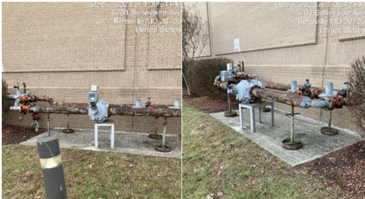
Image 1 front view of leaking gas meter & Image 2 angle view of leaking gas meter.