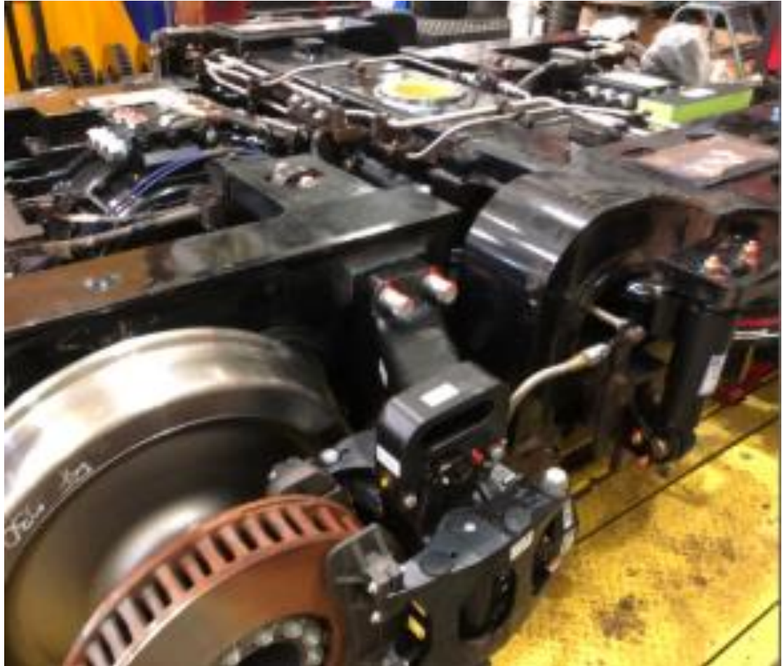
Fig 1 The 7K Rail Series' Trucks being overhauled at Dulles Yard