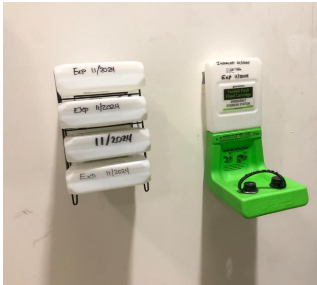
Fig 7 eyewash stations expired or empty