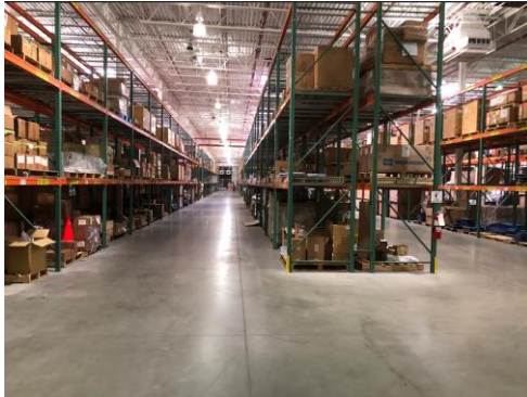
Fig 2 PMO office is running out of floor space