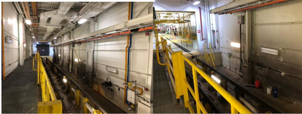
Fig 5 and 6 burned out or broken lights in the blow pit