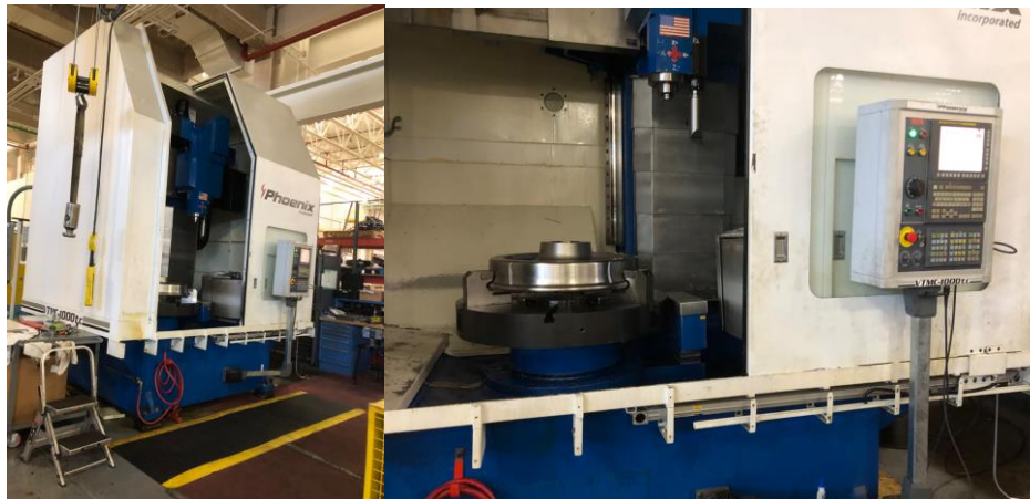
Fig 3 and 4 The Phoenix wheel boring machine at Dulles (not operational at the time of this inspection)