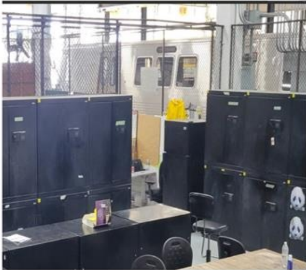
Outdated MSRPH in employee break-locker area at C99 Yard Alexandria Va.